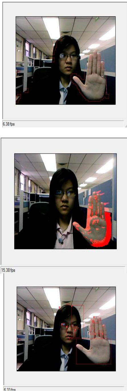
Figure Result image (from left) using Current vs. Previous Frame, Pixellate Filter, Blob Counter and Morph Filter with increasing motion speed.