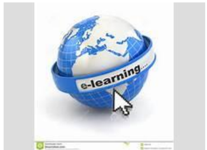
Fig. 3 Globalization of E-Learning